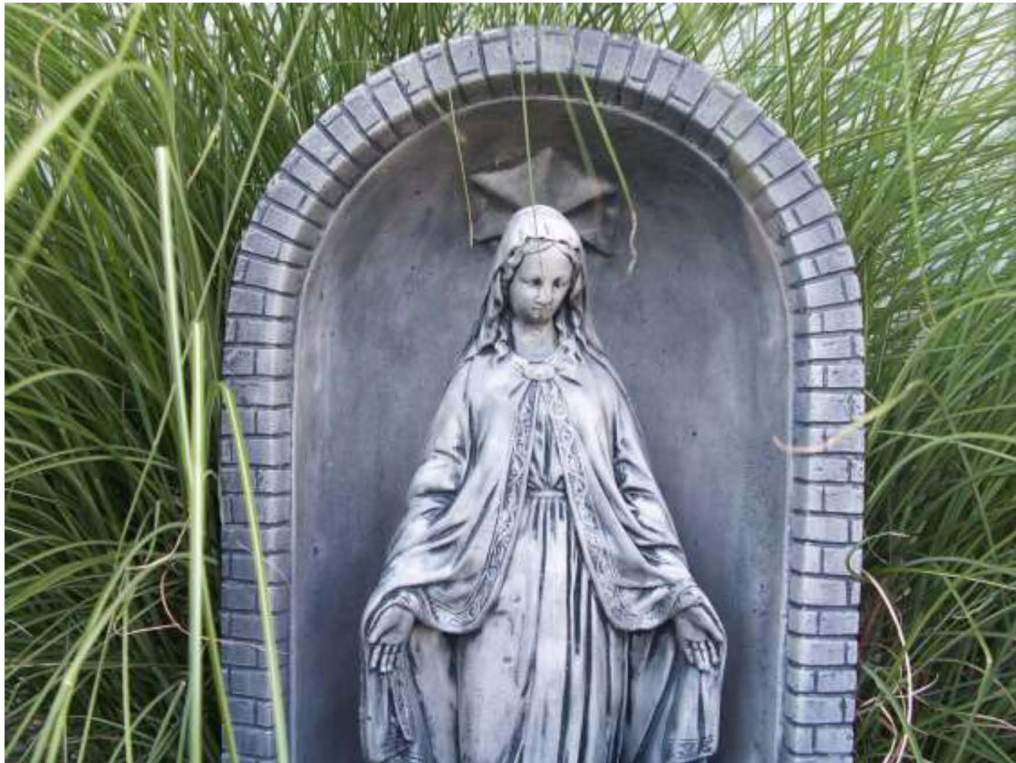
Our Lady Star of the Sea